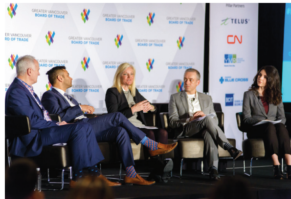
Session 2 of GVBOT's Housing Forum delves into the topic of creating more supply, increasing density, and improving affordability across our region. | MATT BORCK