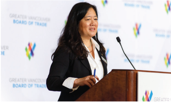
The Honourable Naomi Yamamoto gives the opening keynote at GVBOT's inaugural Emergency Preparedness Forum on April 7.