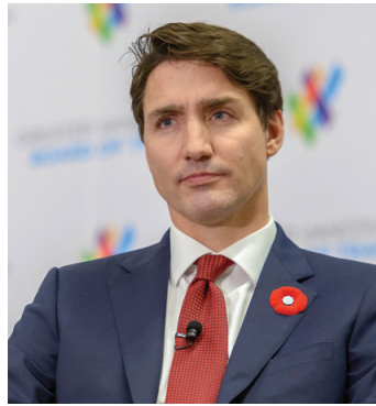
Prime Minister Justin Trudeau spoke at the Greater Vancouver Board of Trade last November about Canada's free trade agreements. Last month, Trudeau's Liberal Party won the most seats in the federal election.

The deficit is likely to increase from current levels of $20 billion per year. The Liberals promised between $9-17 billion in new spending per year over the next four years while the NDP proposed $35 billion in new spending in the first year.