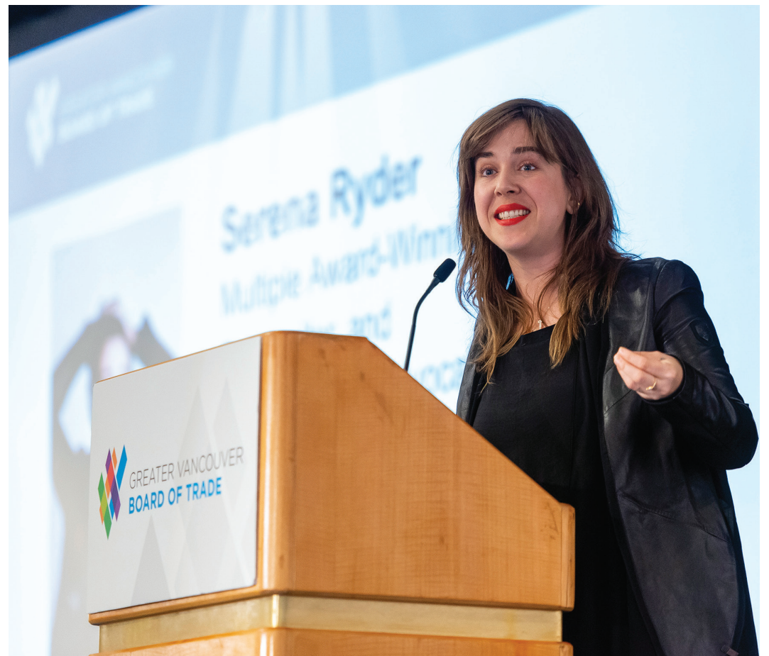
Award-winning singer-songwriter Serena Ryder delivers a passionate and powerful keynote address on her personal mental health journey. 'It's when we don't allow ourselves to fall apart that we become mentally ill,' Ryder told the crowd at GVBOT's Women's Health Care Forum presented by Pacific Blue Cross.

Did you know the Greater Vancouver Board of Trade hosts more than 100 speaker events, seminars, and networking receptions each year?