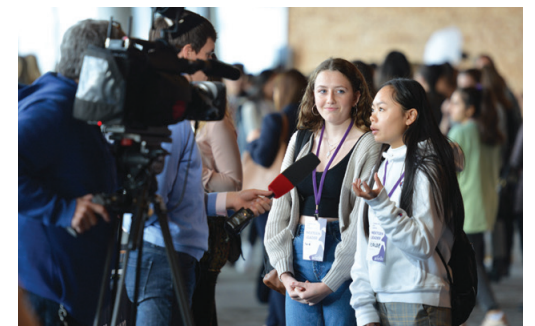
A camera crew from CBC Vancouver stopped by the conference to interview students about their views on the importance of gender equality and creating a more equal future. | MATT BORCK