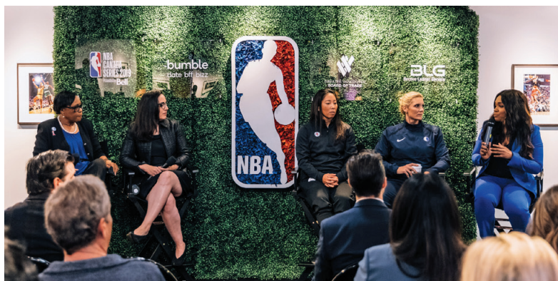
The Board of Trade partnered with National Basketball Association to host a conversation with senior executives from the Dallas Mavericks and LA Clippers on Oct. 17, prior to the NBA Canada Series at Rogers Arena.