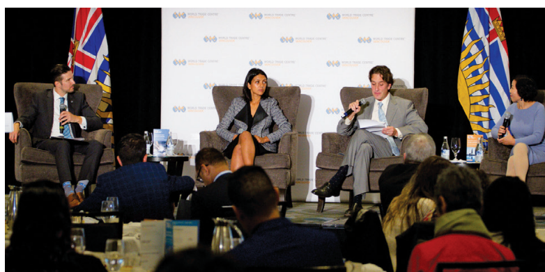
World Trade Centre Vancouver hosted a panel discussion on Sept. 27 on how to develop and deploy an integrated Asian export strategy. The discussion took place after the presentation of the TAP Export Plan Awards.