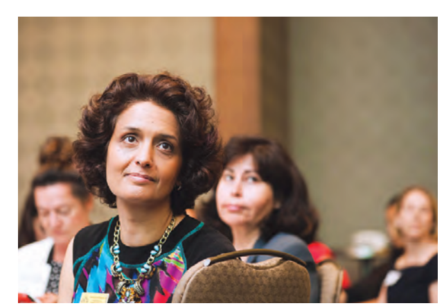
Event attendees look on during the May 27 Morning Leader panel discussion, which focused on the parallels between building a strong sports team and a strong business team. For more photos from this event, visit facebook.com/vancouverboardoftrade.