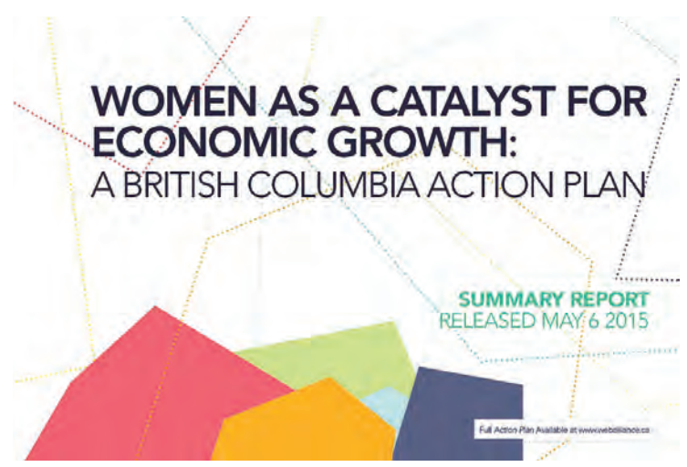
Want to become a Change Champion? Download the Action Plan at boardoftrade.com.

During our October 2014 forum, more than 400 community leaders and influencers from across the province came together to generate ideas and actionable recommendations for change. The focus was on three areas: growing the number of women in senior leadership