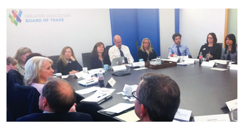
Canada's Minister of Small Business and Tourism Bardish Chagger (far right) visited the Greater Vancouver Board of Trade's office on March 29 for a roundtable discussion on female entrepreneurship. The event was co-hosted by the Women's Enterprise Centre.