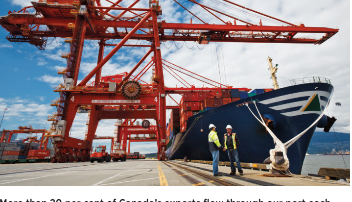
More than 20 per cent of Canada's exports flow through our port each year, yet there was no mention of the Pacific Gateway or trade-enabling infrastructure in the 2016 federal budget. | PORT METRO VANCOUVER

The lack of specifics in the budget unfortunately tempers some of "the good" listed above. While supports for industries such as high-tech