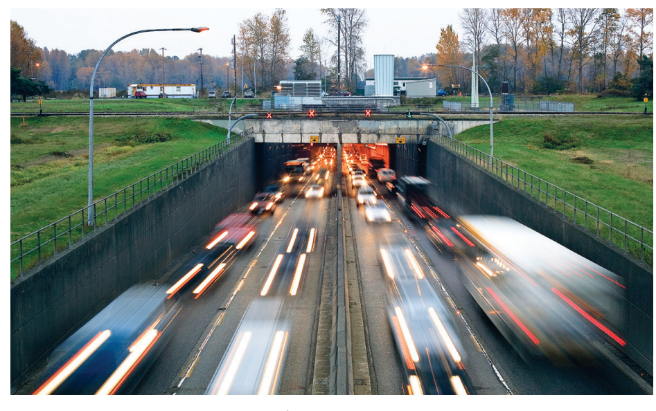
The George Massey Tunnel replacement is one of several key projects across the region that The Vancouver Board of Trade is urging the federal government to invest in.

"It's crucial that the government uses the new infrastructure fund to invest in B.C. \,