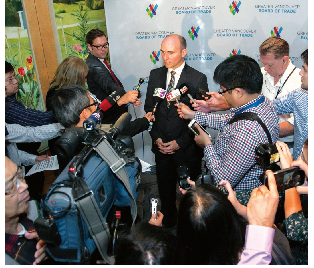
Jean-Yves Duclos, Federal Minister Responsible for the Canada Mortgage and Housing Corporation, speaks to reporters following his Sept. 14 address to the Board of Trade, entitled 'Let's Talk Housing.' Duclos was in Vancouver gathering feedback for the creation of a national housing strategy.