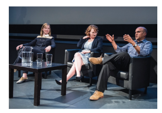
The Leaders of Tomorrow mentorship program partnered with CPA BC to host an event with accounting leaders on Aug. 17. Learn more at boardoftrade.com/LOT.