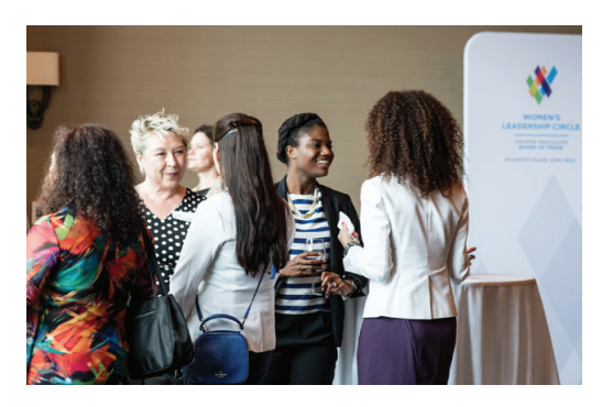
Members of the Women's Leadership Circle make connections during a July 7 event at the Terminal City Club. Want to get involved? Visit boardoftrade.com/WLC.