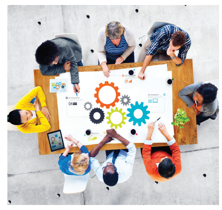
Could your business benefit from fresh, new ideas? Let our Small Business Council pair you up with some of our region's top business students. Learn more at boardoftrade.com/pep.

By joining the program, your company will gain direct access