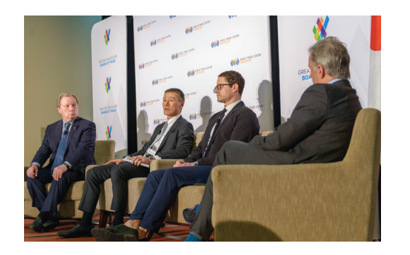
A panel of industry experts, including the CEO of Mitsubishi Canada and the former Canadian Ambassador to Japan, discuss business opportunities for B.C. companies in Japan.