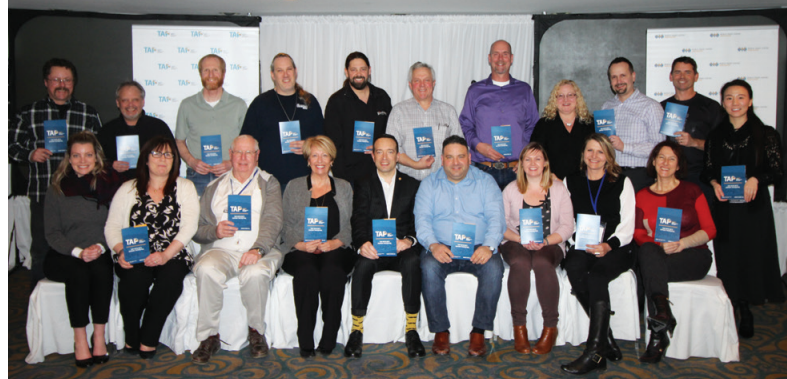
World Trade Centre Vancouver took its Trade Accelerator Program to Kamloops in late February, helping businesses from B.C.'s interior prepare to export their products and services. Learn more about the program at tapbc.ca.