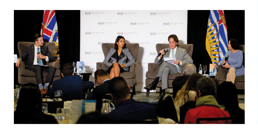
World Trade Centre Vancouver hosted a panel discussion on Sept. 27 on how to develop and deploy an integrated Asian export strategy. The discussion took place after the presentation of the TAP Export Plan Awards.