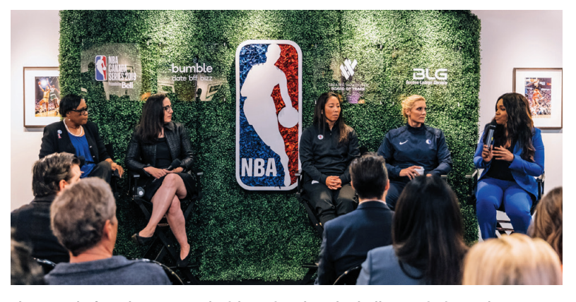
The Board of Trade partnered with National Basketball Association to host a conversation with senior executives from the Dallas Mavericks and LA Clippers on Oct. 17, prior to the NBA Canada Series at Rogers Arena.