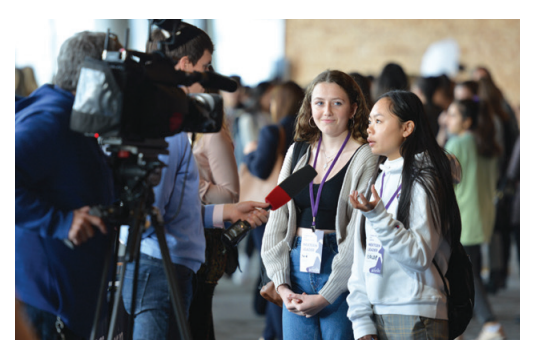
A camera crew from CBC Vancouver stopped by the conference to interview students about their views on the importance of gender equality and creating a more equal future. | MATT BORCK